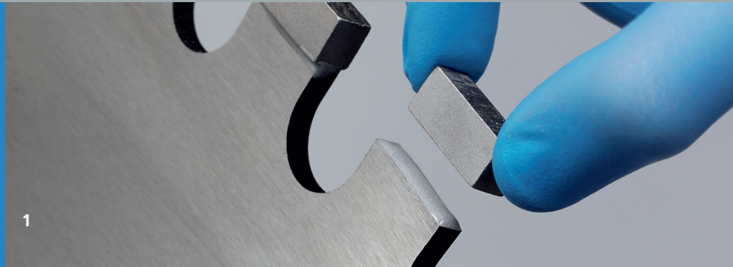
1 Saw blade with bonded on cutting segments for cutting granite.