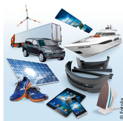
Figure 2: DIN 2304 – an industry-wide user standard for all types of bonded joints

As a consequence, the often chided quality management system (QMS) of ISO 9001 has the fundamental aim of