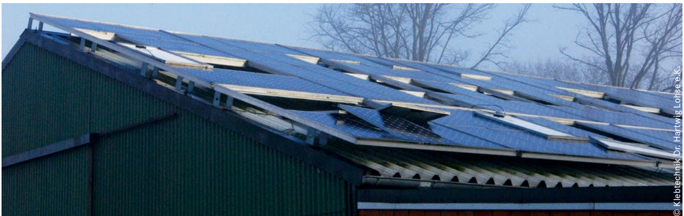
Figure 1: Row by row failure of bonded joints after exposure to high winds. Joint failure between the solar modules and aluminum base due to serious bonding faults

DIN 2304 is consequently a user/application standard. Its specific aim is to