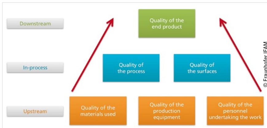
Figure 5: Upstream, in-process, and downstream quality assurance

characterizing the quality of an end product (Figure 5).